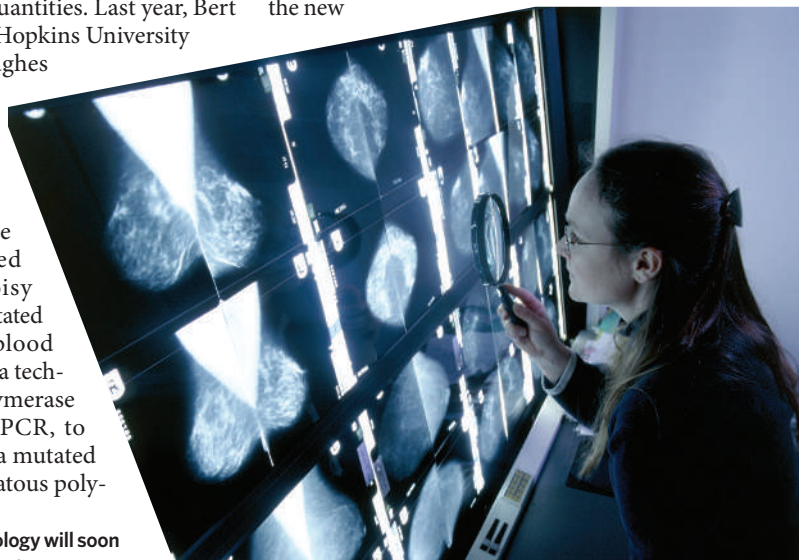
Medical imaging technology will soon

Given that there is no such thing as a single magic marker for any cancer, Quake feels that the ideal way to detect early disease would be to sequence and so identify all the hundreds of thousands of molecules in a blood sample. “As crazy as it sounds, this is something that is coming within reach of the new